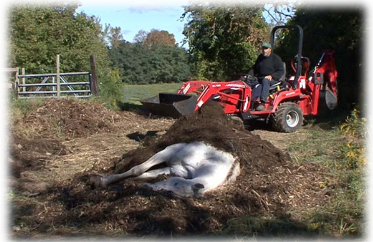
Horse being covered in woodchips.